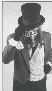
Victorian garb is old hat for the members of Steampunk Salon Saloon.

"You might think it's someone just talking to themselves, but they're performers," Mass says. Also, "Motherless Brooklyn" writer (and Brooklyn native) Jonathan Lethem will do a Q&A, reading