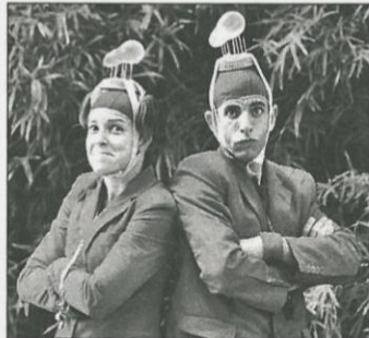
The Acrobuffos will be clowning around.

■ Something completely different: What's an art show without a little